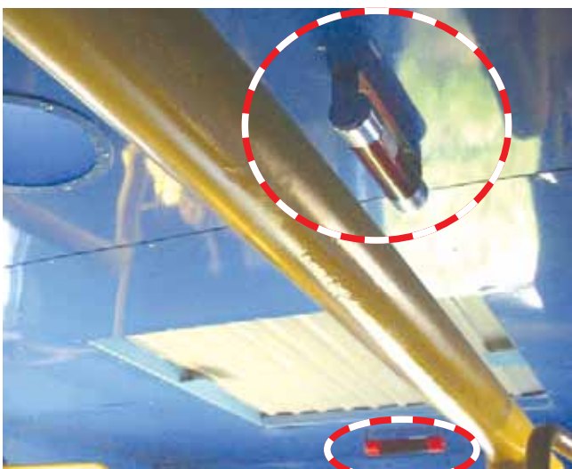
Implementation of the ampoule BONPET engine room ceiling