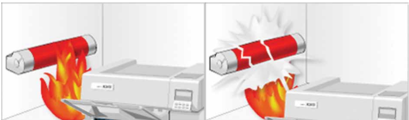
Function application process ampoules BONPET

In most cases these points can not be covered by volumetric technical systems (whole sprawling etc.) due to uneconomic cost, but statistical surveys proves that there are the areas most fires starts.