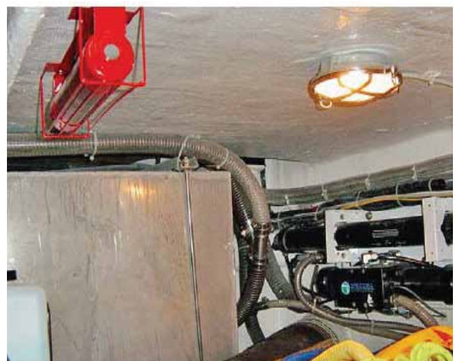
Implementation of the ampoule BONPET near electronic equipment that is impossible to meet with systymata whole sprawling